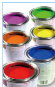
Paint & Ink